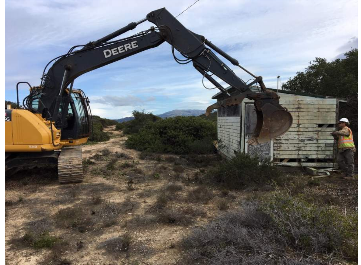
A) Workers spent several days gaining entrance to the structures in Unit 13 by clearing the old access road.