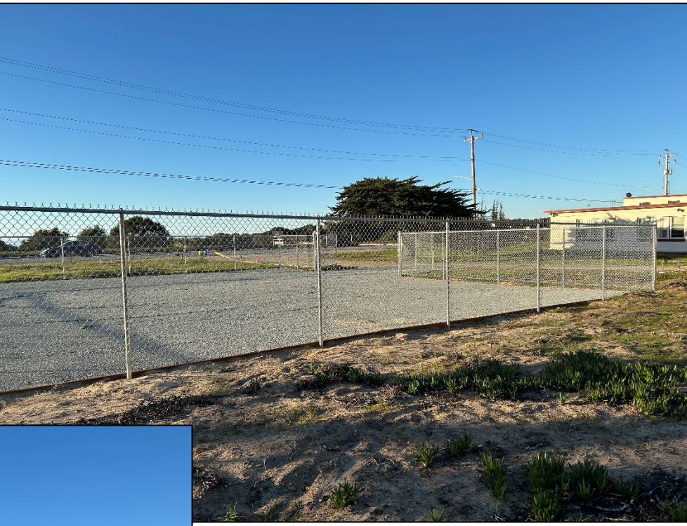
Photo 5. Main Garrison Fire Station old soil area (now gravel parking lot) where AFFF was discharged.