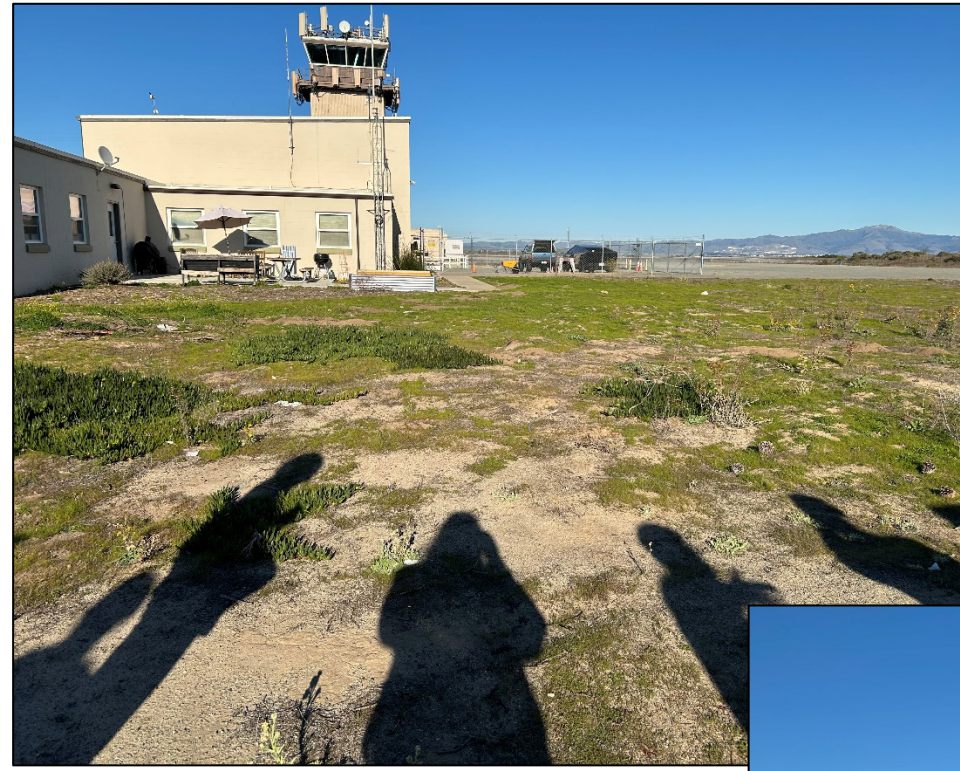
Photo 3. FAAF Fire & Rescue Station soil area where AFFF was discharged.