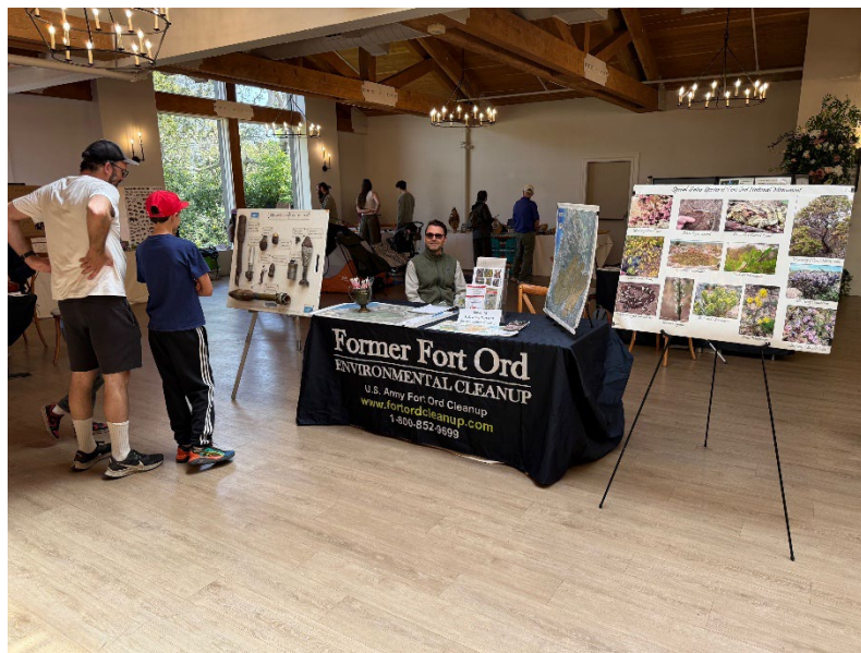
California Wildlife Day