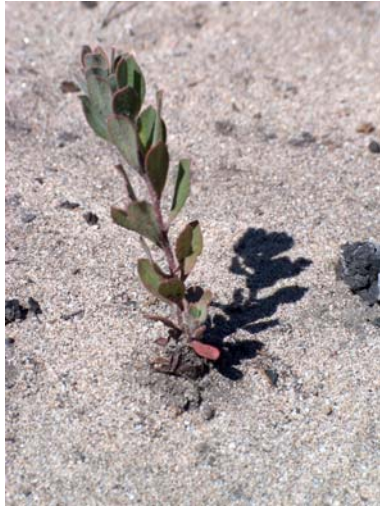
Shaggy bark manzanita