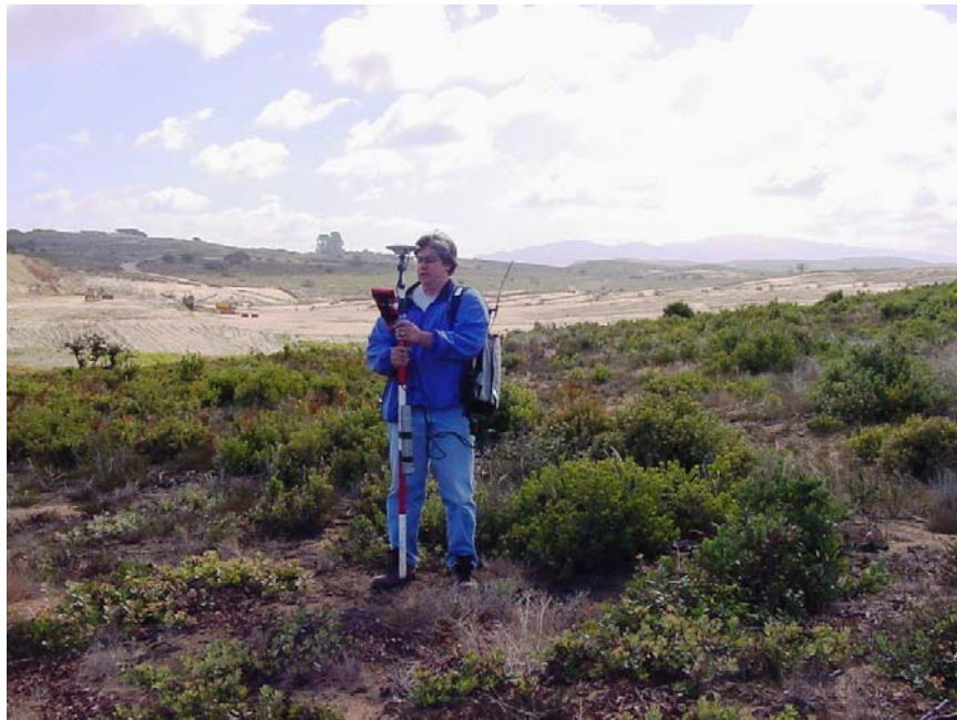
Photograph 9 – Transect 291, showing Range 45 sift area in the background. One of the original transects in the sift area was omitted from the 2005 survey.