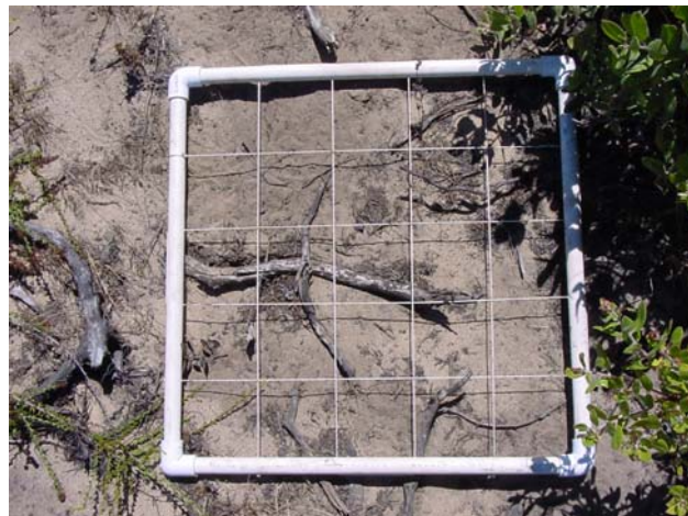
Photograph 7 – Quadrat with a high percent cover of bare ground.