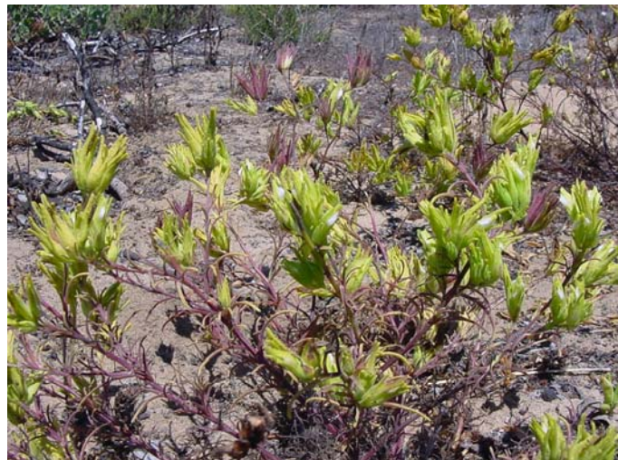
Photograph 18 – Seaside bird's-beak