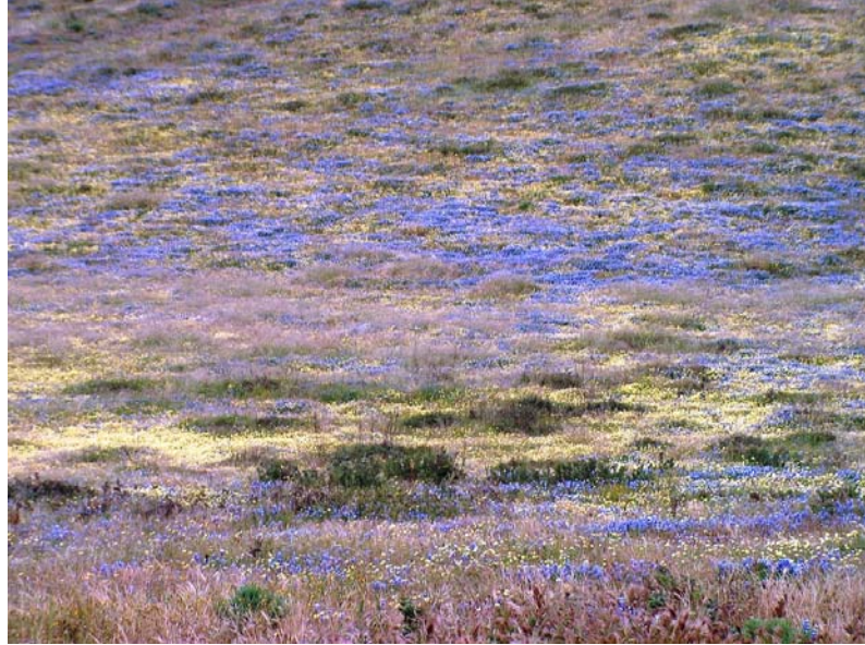
Photograph 16 – View of Range 43-48 grasslands showing extensive annual plant blooms after winter rains of approximately 31 inches (19 inches is about average).