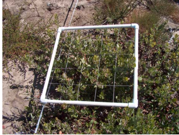
Photograph 5 – Quadrat showing high percent cover of shaggy bark manzanita, but no seedling growth due to canopy cover.