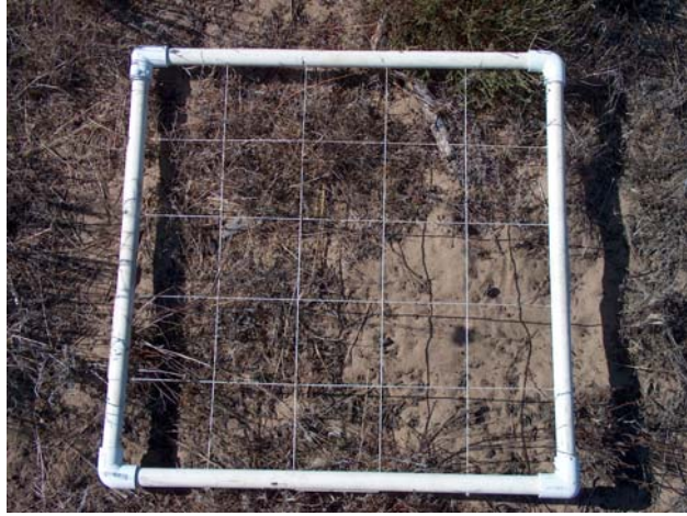
Photograph 8 – Quadrat with a high percent cover of dead vegetation and bare ground.