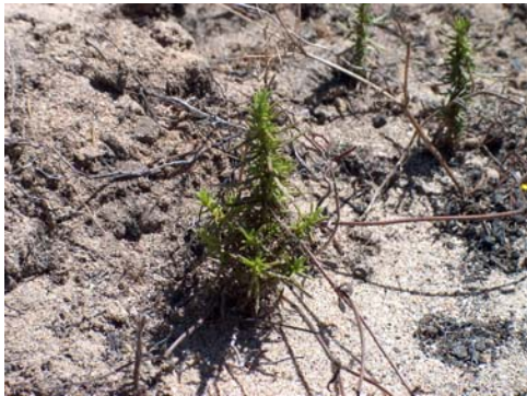
Eastwood's golden fleece