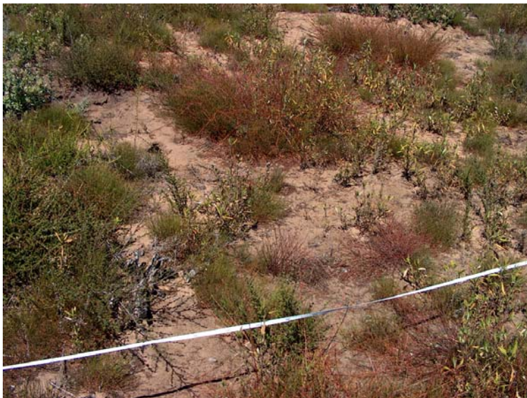
Photograph 4 - Typical view of vegetation along transect line BF4 (Zone A) in an area with a high percent cover of bare ground between plants.