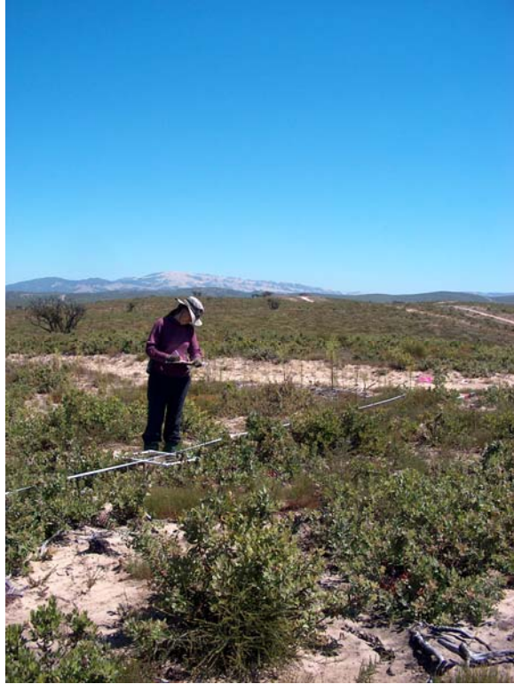
Photograph 3 – Typical view of vegetation along a transect line from above, showing proportion of bare ground between plants.