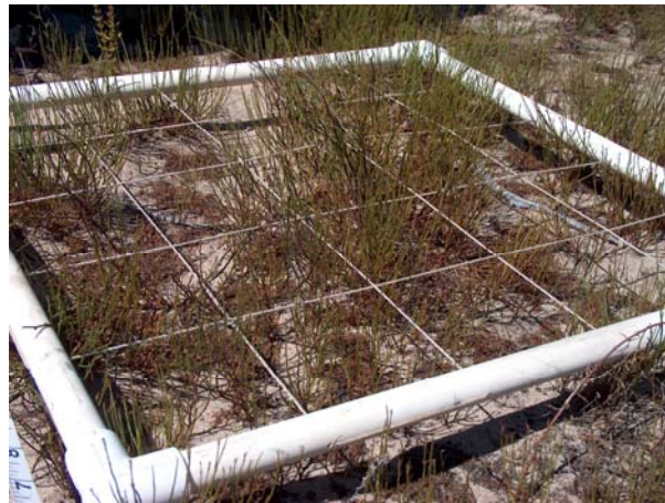
Photograph 6 – Quadrat with a high density of rush rose seedlings.