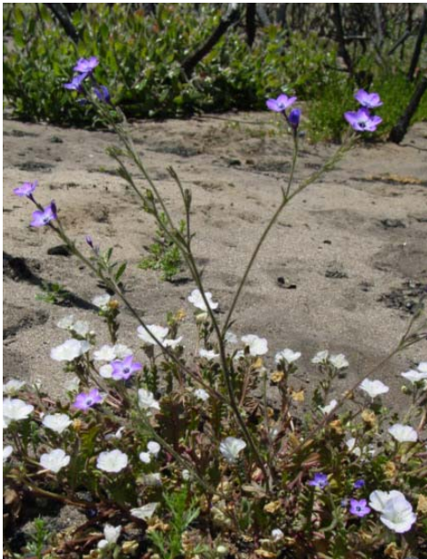
Photograph 17 – Sand gilia