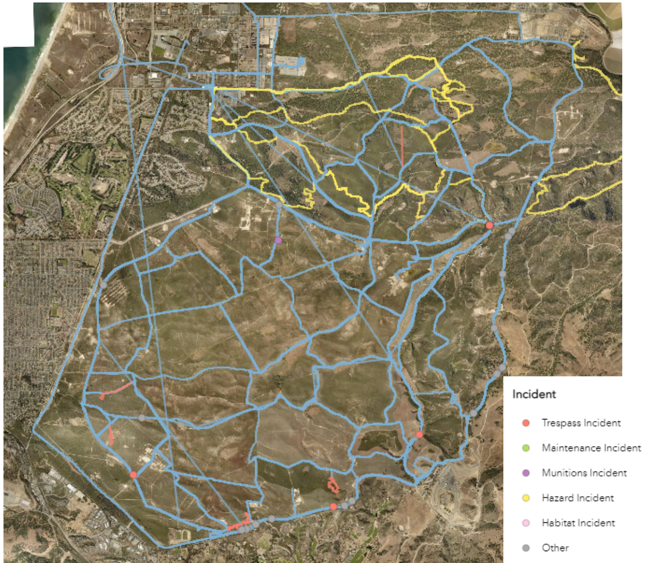
Field check routes in July 2021-September 2021