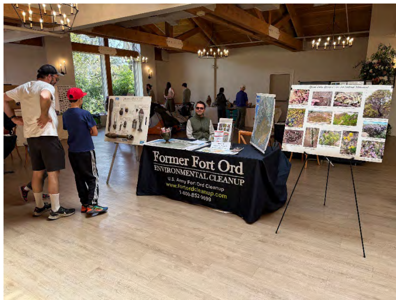
California Wildlife Day