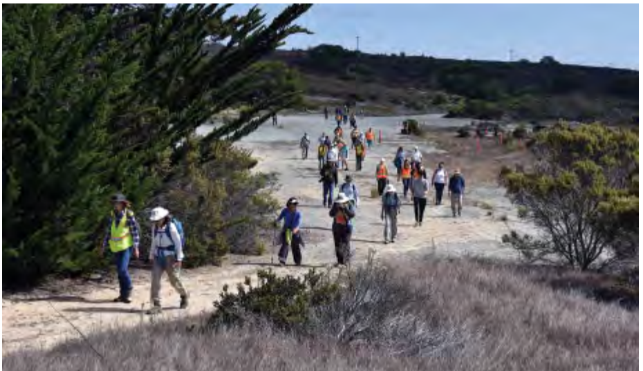
Hikers at the September 18, 2021 Guided Nature Walk inside the Impact Area.

The Army hosts bus tours and open houses on the former Fort Ord for community members interested in cleanup information. The Army will also provide bus tours focused on the various Fort Ord cleanup issues for groups of 25 or more.