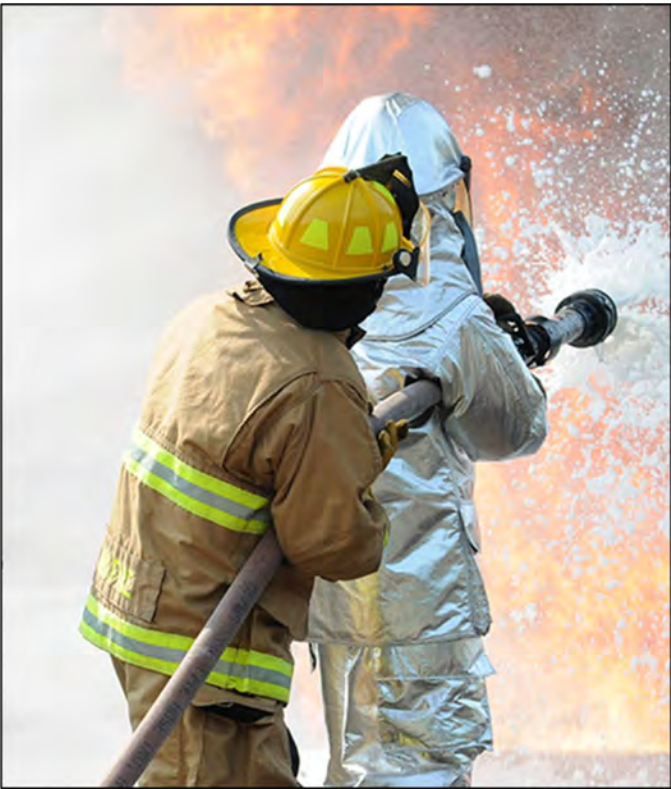
Firefighters using AFFF