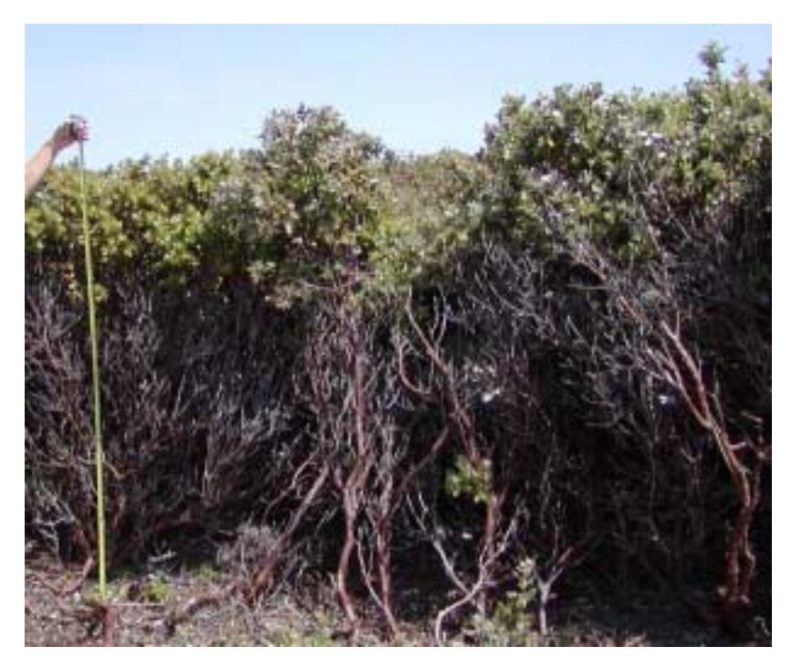
Photograph 1–Brush fuels typical of 30-year-old stands on the southwest side of the burn area. The ruler is held at the 6-ft mark.

FBPS fuel model 4 was utilized, because it fits the on-site mature brush stands shown in Photograph 1.