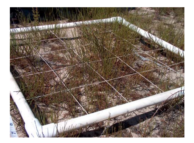
Photograph 6 – Quadrat with a high density of rush rose seedlings.