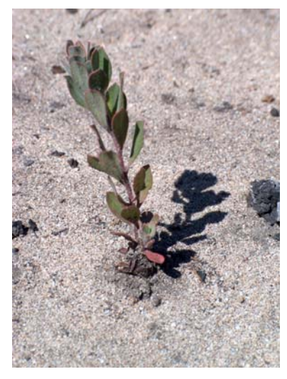
Shaggy bark manzanita