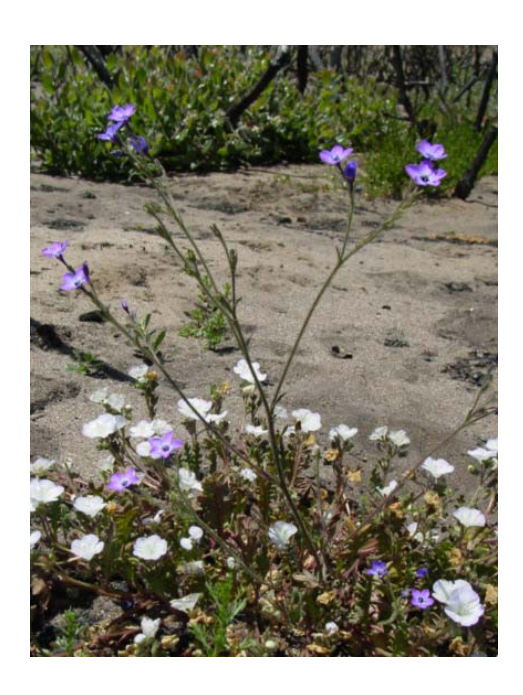
Photograph 17 – Sand gilia