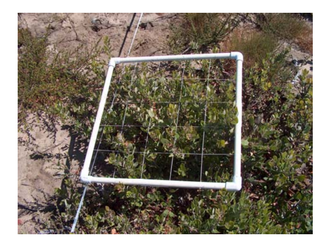
Photograph 5 – Quadrat showing high percent cover of shaggy bark manzanita, but no seedling growth due to canopy cover.