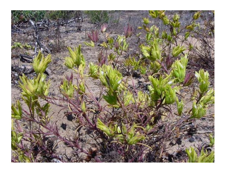
Photograph 18 – Seaside bird's-beak