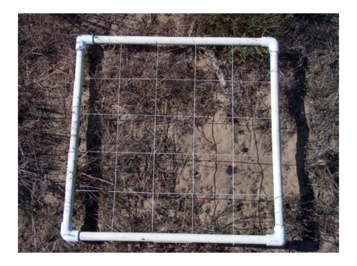
Photograph 8 – Quadrat with a high percent cover of dead vegetation and bare ground.