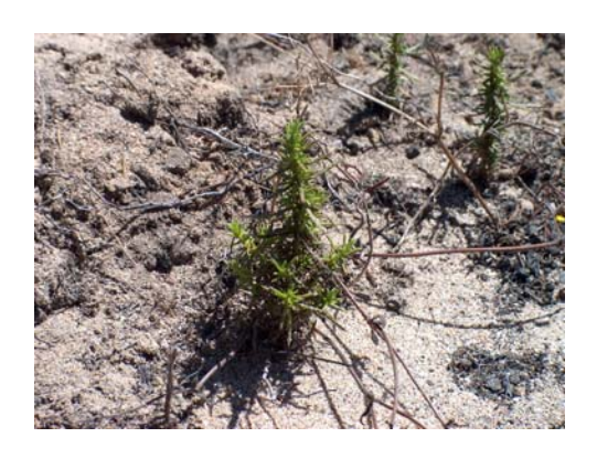
Eastwood's golden fleece