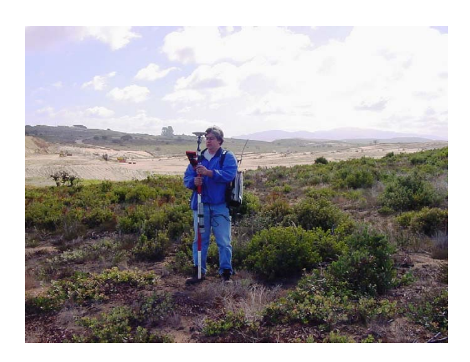
Photograph 9 – Transect 291, showing Range 45 sift area in the background. One of the original transects in the sift area was omitted from the 2005 survey.