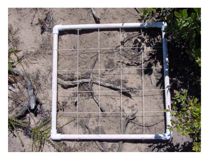
Photograph 7 – Quadrat with a high percent cover of bare ground.