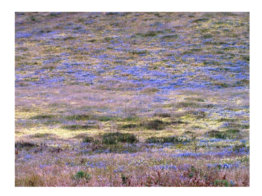
Photograph 16 – View of Range 43-48 grasslands showing extensive annual plant blooms after winter rains of approximately 31 inches (19 inches is about average).