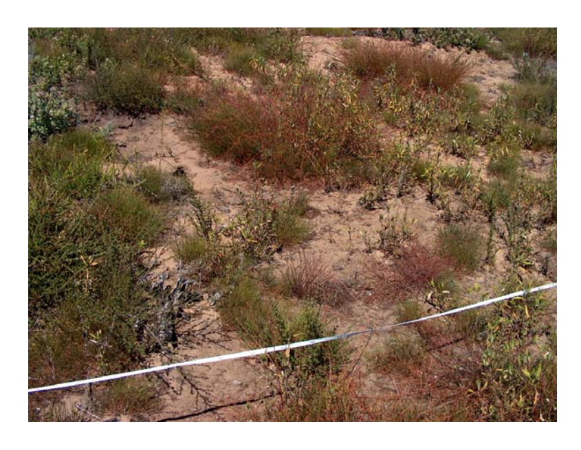
Photograph 4 - Typical view of vegetation along transect line BF4 (Zone A) in an area with a high percent cover of bare ground between plants.