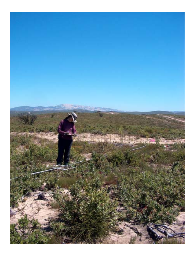
Photograph 3 – Typical view of vegetation along a transect line from above, showing proportion of bare ground between plants.