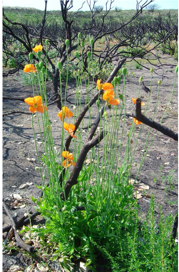
Fire poppies are one type of plant that germinates following a burn.

The voluntary relocation program was discontinued after 2006. Since then, the Direct Notification Program has been successfully implemented to provide timely information to the public regarding the status of each planned burn at the former Fort Ord. The Army acknowledges that some prescribed burns can affect air quality and can affect sensitive individuals. Therefore, the Army has taken numerous steps to design prescribed burns that will minimize smoke impacts in the surrounding community such as conducting a prescribed burn when an appropriate combination of atmospheric conditions and moisture levels in the vegetation occurs. In addition, analysis of the smoke from Fort Ord prescribed burns indicates the smoke is the same as any other vegetation burn. Community notification and smoke management can minimize potential impacts from smoke. Through community notification, the public is advised of reasonable precautions they can take to minimize exposure to smoke from prescribed burns, such as staying