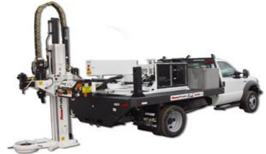
Photograph of Typical Drilling Equipment

WHAT? The Army will be installing a pilot treatment system to collect and treat soil gas. The information collected from this treatment system will be used to evaluate the presence of shallow soil gas originating from groundwater contamination in this area. Typical equipment will include drilling and other heavy construction equipment such as back hoes and trucks. A photo of typical drilling equipment is shown to the right. During drilling, you may see some parking spaces or other small areas of the parking lot or sidewalk coned off to allow for the safe operation of equipment and workers. In order to maintain safety during the drilling, we will be restricting access to the public in the immediate area of the drill rig. Additionally, you may hear very brief periods of loud sounds from the drill rig. A map of the locations where the construction will occur is shown on the reverse side. It is anticipated that construction will take 2 to 3 weeks. All drilling activities will be conducted according to the California Department of Toxic Substances Control guidance documents.